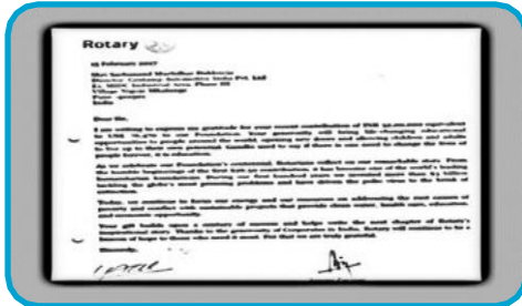
Thank You letter