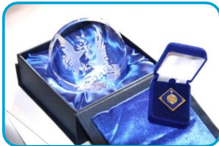
Major Donor Recognition for Corporate Head (Family Run Business)