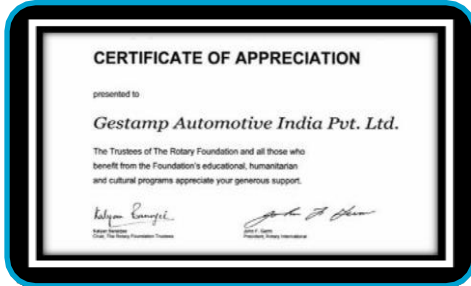
Certificate of Appreciation